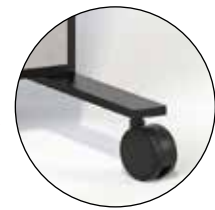
Sleek, Straight-Line Base w/Casters